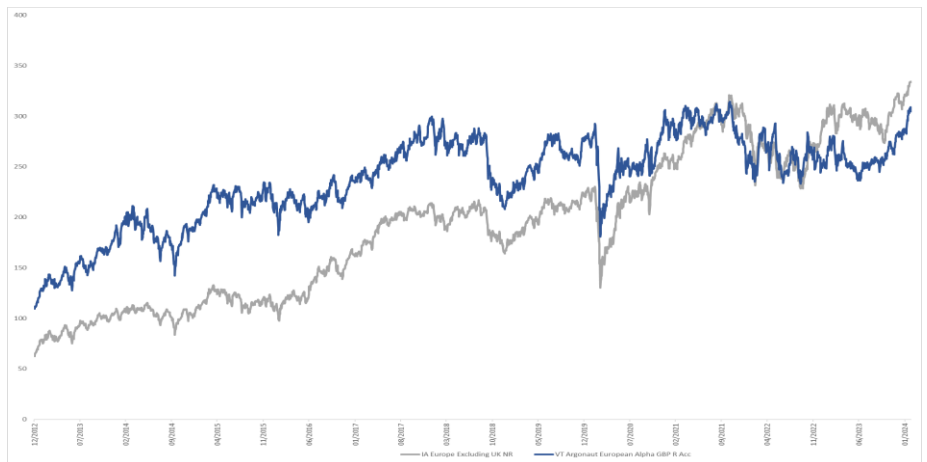
1 Lipper 31/03/2024, R Accumulation share class performance, in GBP with net income reinvested and no initial charges.

Investor information – This fund may not be appropriate for investors who plan to withdraw their money within 5 years.